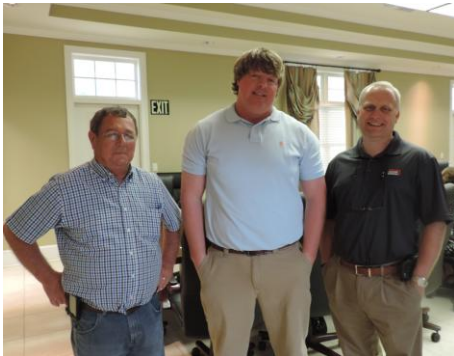
Thank you! 5 th Friday Sponsor ACME Brick, Tile & Stone