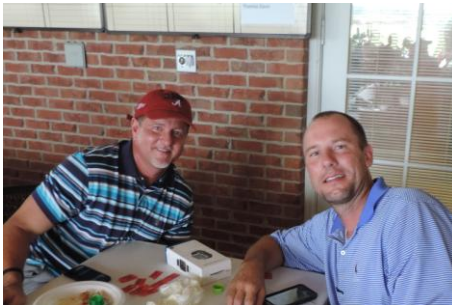
Ready Mix USA Flight 2 Winner